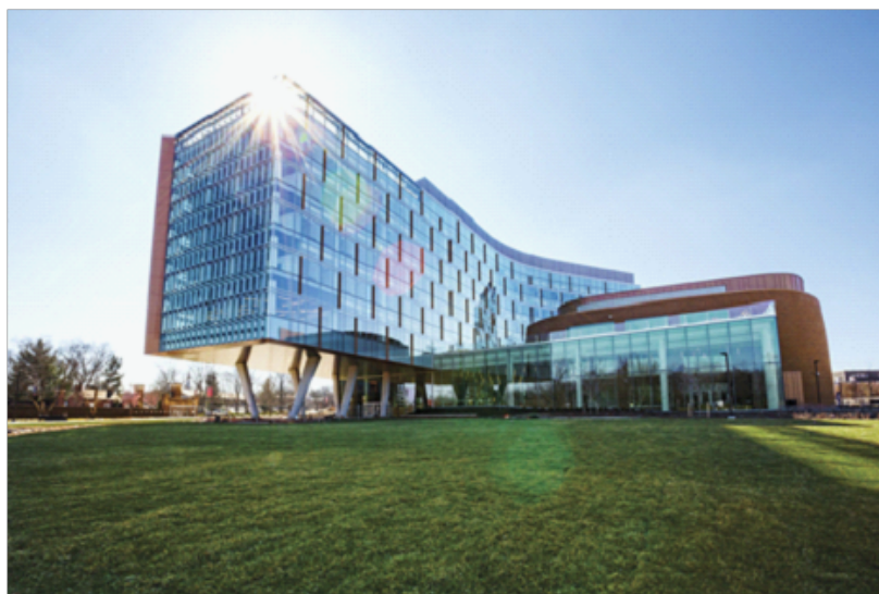
Brendan Iribe Center, UMCP